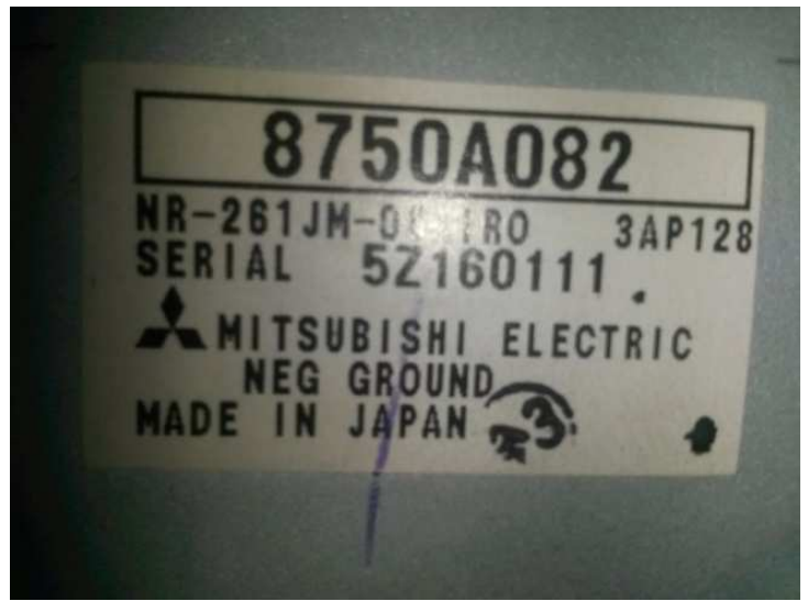
Details on back on MMCS