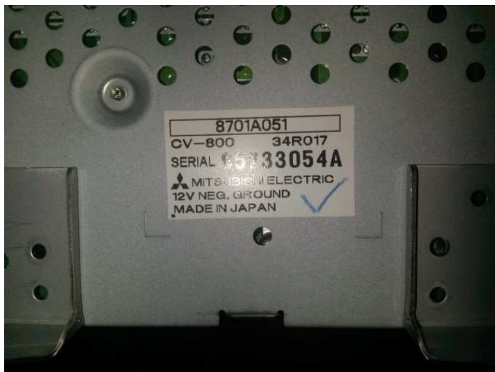
Unit under drivers seat – Amplifier??