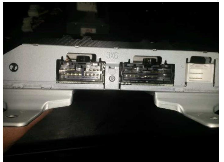
Unit under driver's seat. All 3 connectors were used