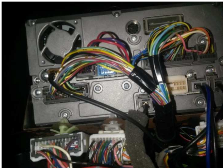
Back of MMCS.