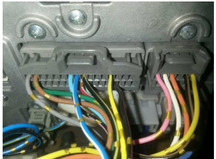
No success feeding audio directly into blue/white with 2 gold bars.