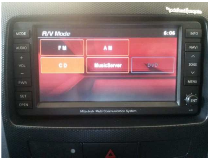
MMCS J-01 after conversion from Japanese to English